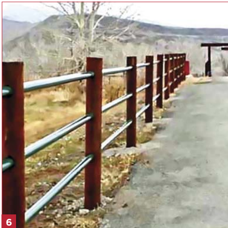
6 Wood post with pipe railing