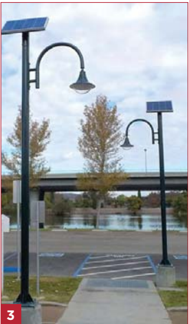
3 Pedestrian scale solar lighting