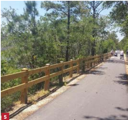
5 Split rail fence