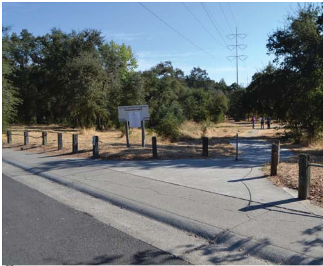
6 Entrance to Sundace Park - Existing