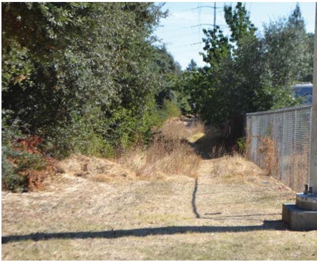
7 Typical Trail Alignment North of Woodmore Oaks - Existing