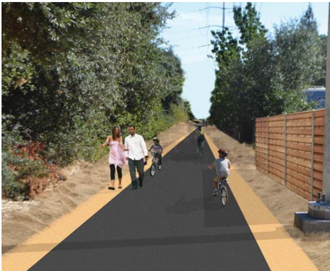
7 Typical Trail Alignment North of Woodmore Oaks - Proposed