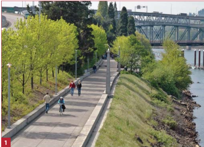
1 Well maintained, clean areas with clear sitelines are less likely to be vandalized and are more comfortable for the user