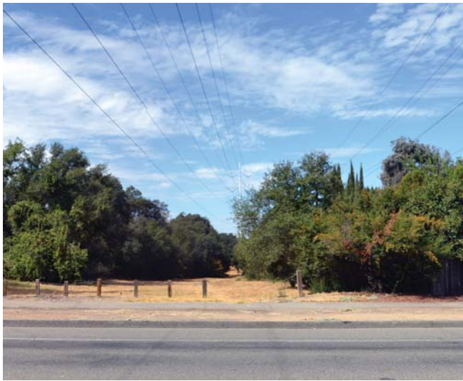
8 Alignment at Wachtel Way - Existing