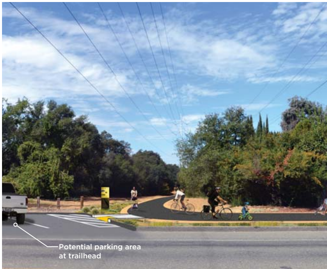
8 Alignment at Wachtel Way - Proposed