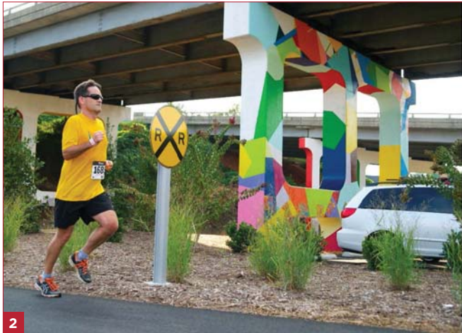
2 Public art can brighten a space and make it feel safer