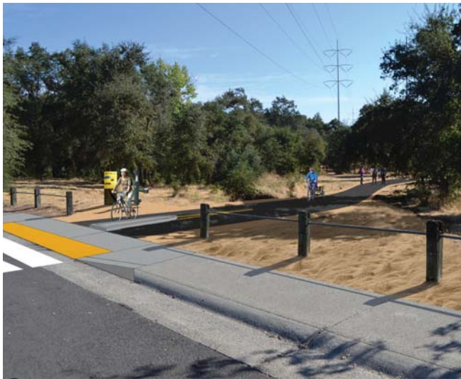
6 Entrance to Sundace Park - Proposed