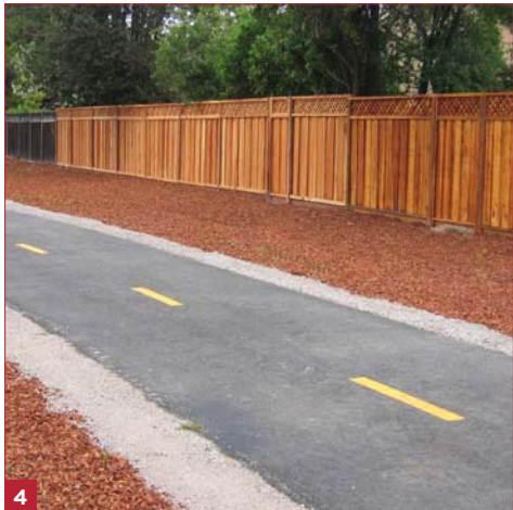
4 Privacy fence with access gates